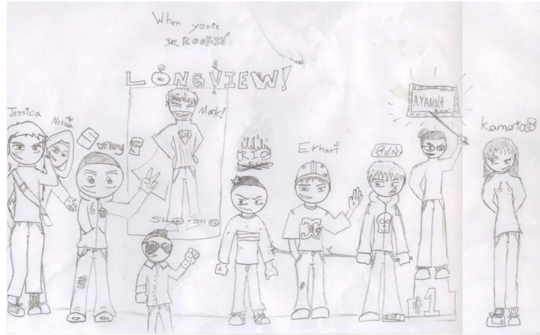
Sunny's Drawing of Longview School students