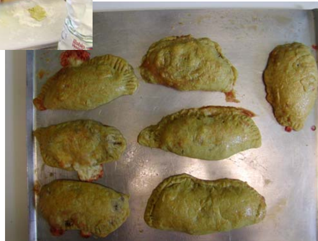
Jamaican beef patties