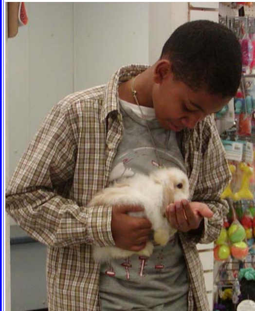
Sunasian Feeding the Rabbit