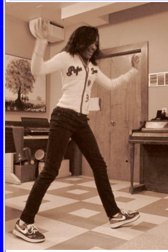
Longview Family Pot Luck Dinner