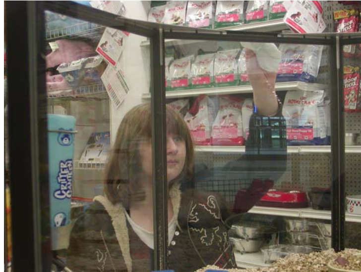
Rose Cleaning a Rabbit Cage