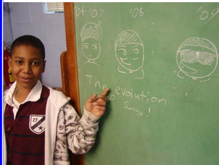
The Evolution of Sunny